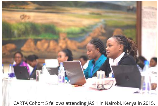
CARTA Cohort 5 fellows attending JAS 1 in Nairobi, Kenya in 2015.