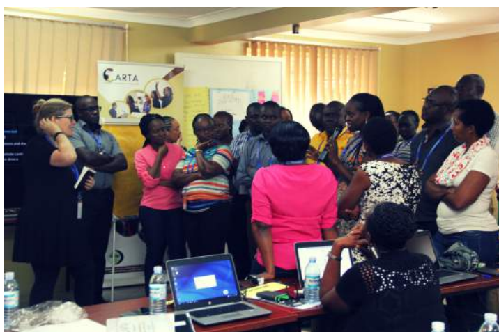
Fellows participating in the Joint Advanced Seminars at Makerere University in Kampala, Uganda February - March 2017.

CARTA has held 21 one-month long Joint Advanced Seminars (JASes) for the 7 cohorts of fellows.