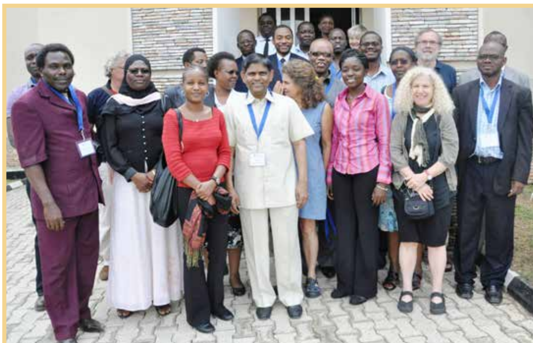
CARTA Partners group photograph, Ibadan, August 2012

In all, 25 Cohort 3 CARTA fellows were selected at the consortium's partners annual general meeting held at the University of Ibadan, Nigeria, in August last year.