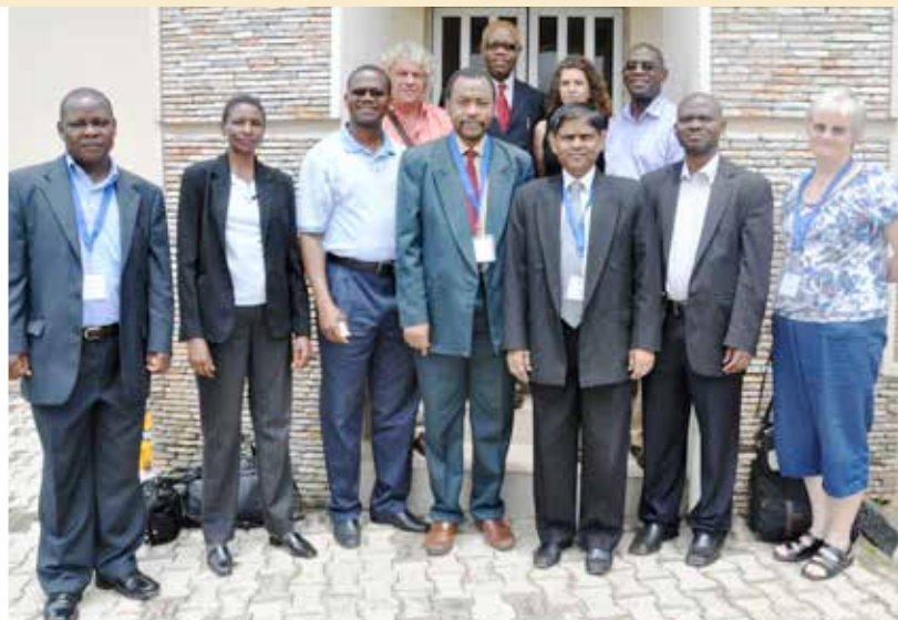
CARTA Board of Management at Ibadan, Nigeria