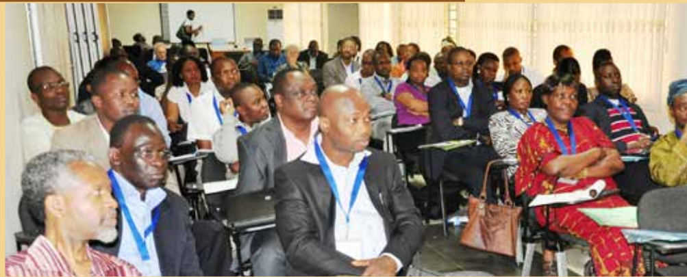
Faculty and administrators training session, Ibadan, Nigeria

Presentations at the plenary tackled topics designed to strengthen and manage re-