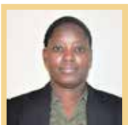
Olufunmilayo Olufunmilola Banjo Obafemi Awolowo University

Research area: Pathogen survival in different physical and biochemical conditions in ecological sanitation latrines and their associated health risks..